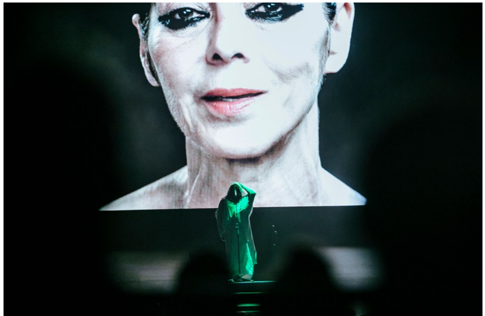
Anohni Hoplessness Tour